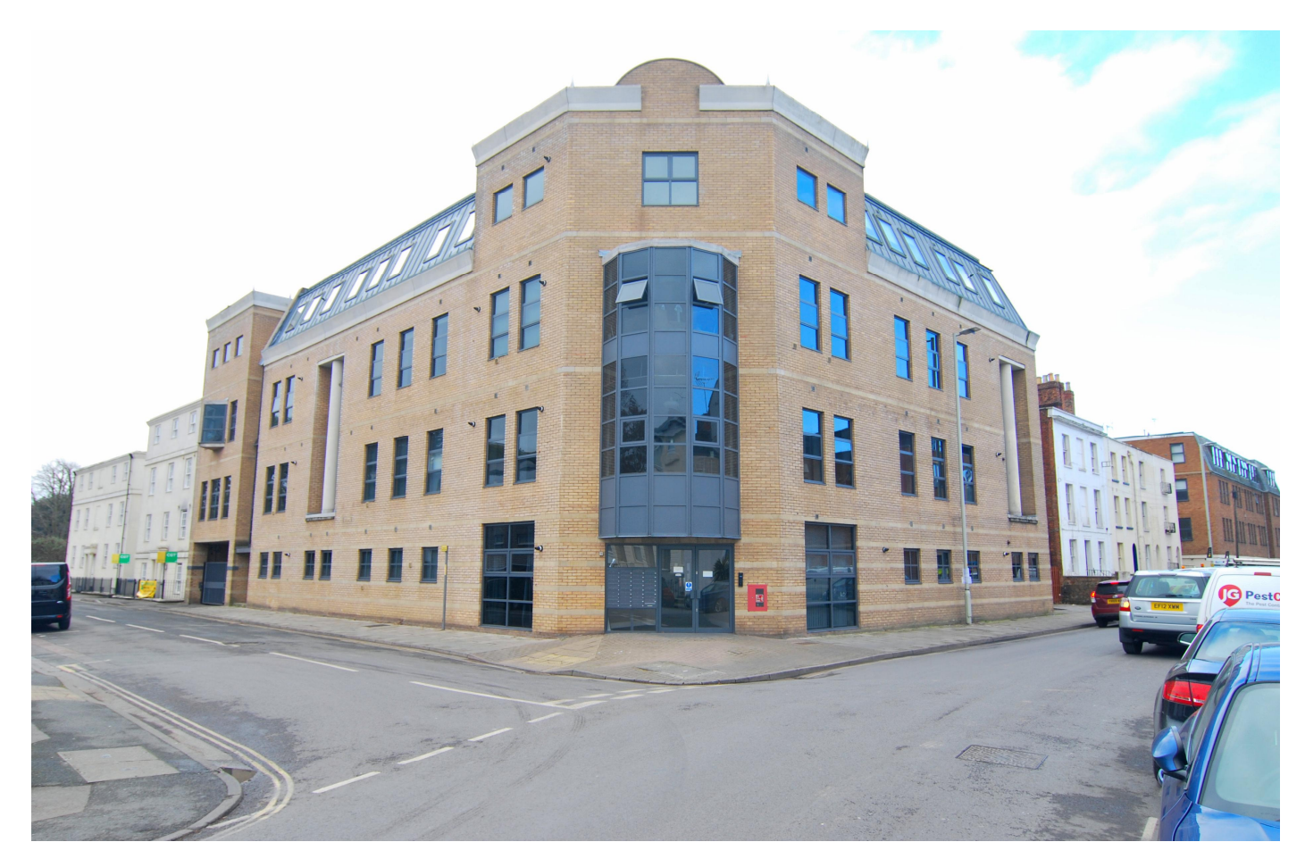
Flat 8, Fitzalan House, Park Road, Gloucester, GL1 1LW